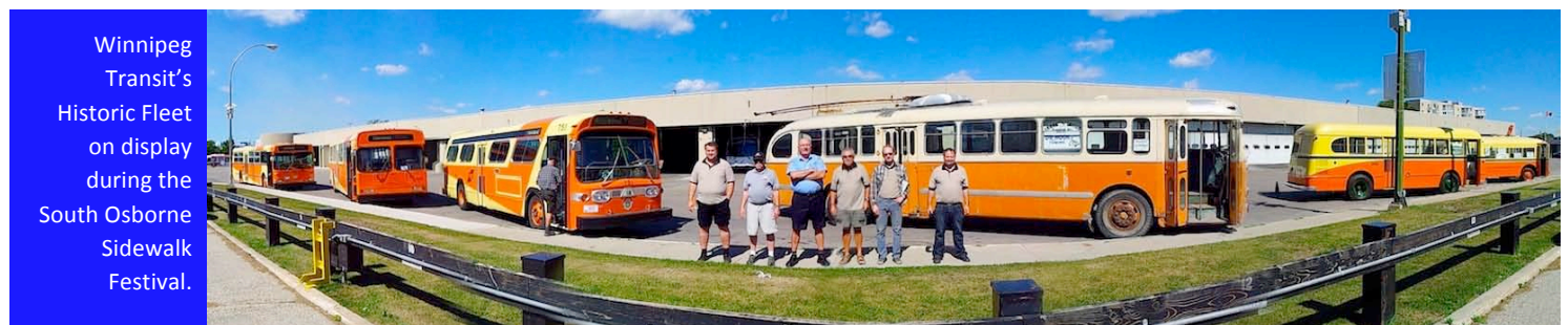
Winnipeg Transit's Historic Fleet on display during the South Osborne Sidewalk Festival.

The sidewalk festival stretched from Mulvey Avenue in the north to Jubilee Avenue in the south, and featured street performers, a petting zoo, horse drawn wagon rides, and a local merchants sidewalk sale.