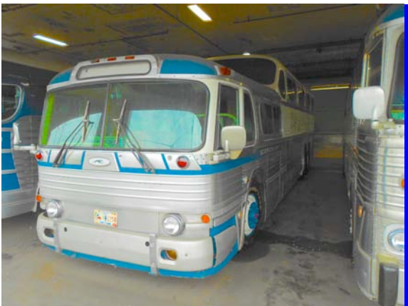
1954 General Motors model PD5401-001 “Scenicruiser” was the iconic coach in the 1950s.