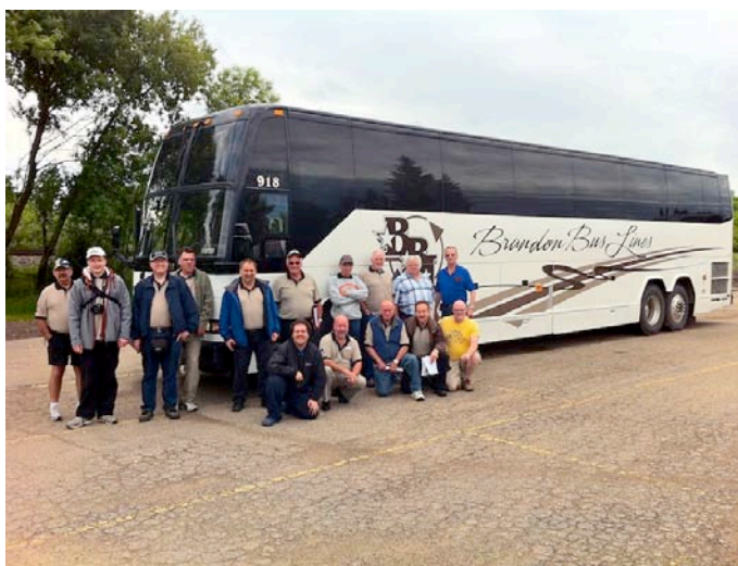
A group of MTHA members from Winnipeg made the trek out west to Brandon for the AGM. Many new members were recruited from the wheat city.

The activities for the day including the AGM Business meeting followed by a luncheon at Mom's Family restaurant (located on the City's picturesque golf course), a tour of Brandon Bus Lines garage, and a tour of Brandon Transit garage and a city tour on their 1955 General Motors vintage coach.