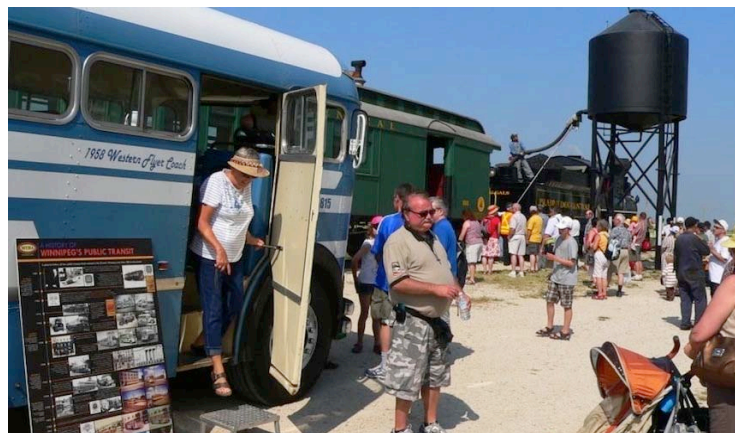
The MTHA's 1958 Western Flyer Coach (bus #75) made an appearance next to the Prairie Dog Central Locomotive at the Trains, Planes and Automobiles event in Rosser, Manitoba.

This event featured the Prairie Dog Central steam locomotive and train, vintage airplane models, and numerous antique automobiles including the Manitoba Transit Heritage Association's 1958 Western Flyer Coach.