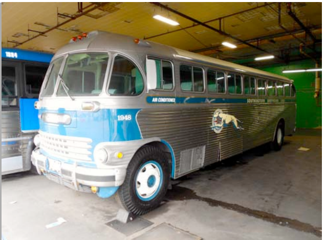
1948 ACF-Brill model IC-41 which was used by Southeastern Greyhound Lines. A similar bus was used by Winnipeg Electric on the Winnipeg to Selkirk route in the late 1940s.