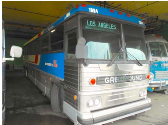
1984 Motor Coach Industries model MC-9 was the mainstay and dependable workhorse of the Greyhound fleet in the 1980s and 90s.