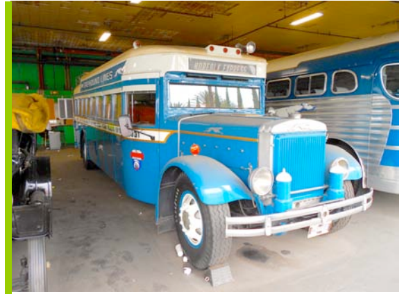
1931 Mack model BK which featured kerosene lamps as the rear lights!