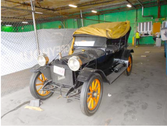
1914 Hupmobile, the vehicle that the “Greyhound Story” began with in Hibbing, Minnesota.

This page features a few pictures of Greyhound’s Historic Fleet based in Los Angeles. These vehicles are often used by the Hollywood movie industry and have appeared in many films over the years.