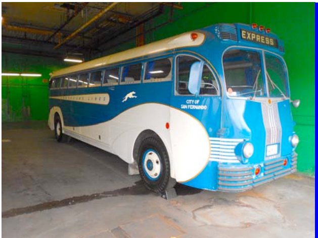
1937 Yellow Coach model 743, the predecessor to the General Motors line of buses and coaches.