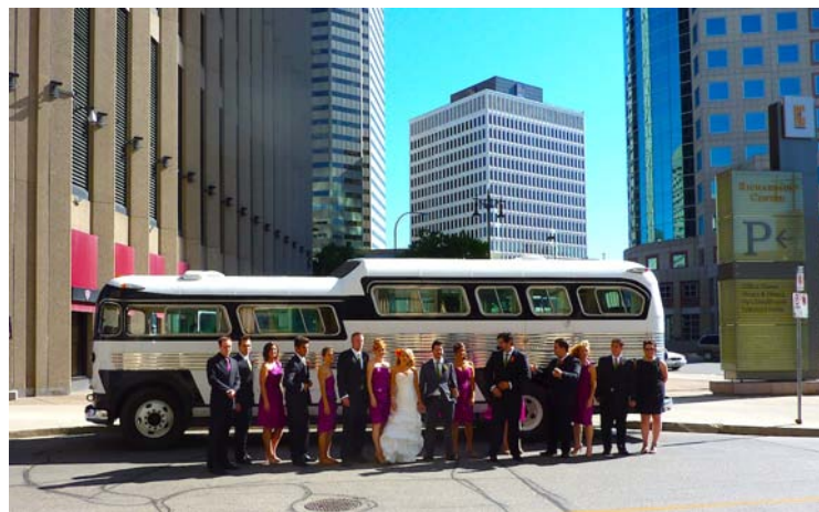
The Bride and groom together with their bridal party staged a group picture with the 1956 Scenic Cruiser at the famous corner of Portage & Main in Winnipeg.

After the ceremony, the couple and their bridal party were taken to the CBC Building, Portage & Main and throughout the historic Exchange District for wedding day pictures.