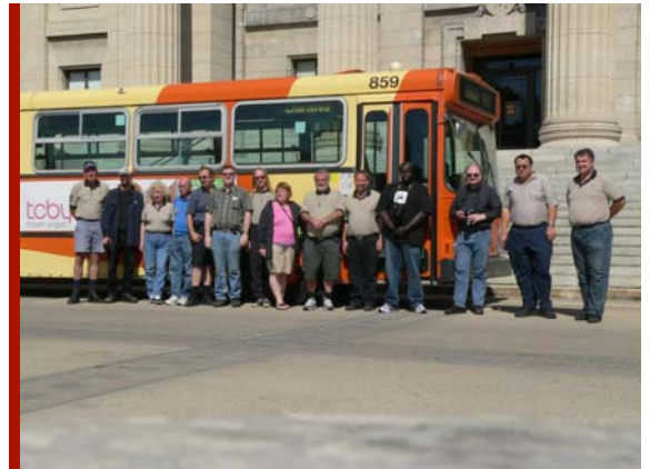
Guests on the bus fan trip gather for a picture in front of Winnipeg Transit bus 859 on the grounds of the Manitoba Legislature.