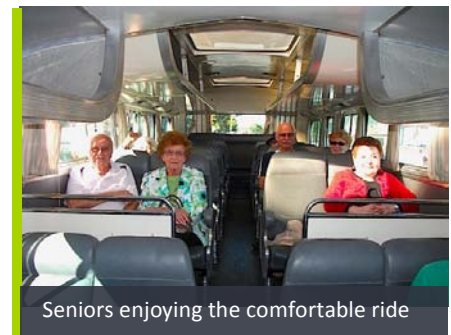
Seniors enjoying the comfortable ride