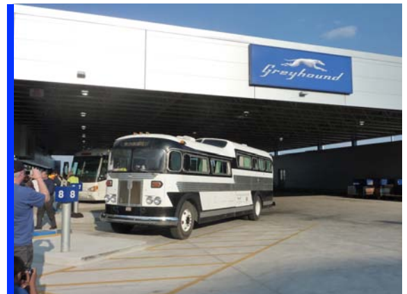
After a long day of tours, the BHA delegates concluded their itinerary with a visit to the new Greyhound bus depot at the Winnipeg International Airport.

A NFI XD40 for Mississauga’s MiWay is loaded for transport to the finishing facility.