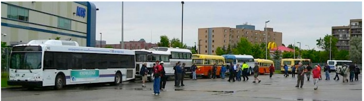
While at Winnipeg Transit the 2011 Bus History Association delegates were free to explore and photograph the display of both vintage and modern buses. Included in the lineup, the MTHA's 1937 Twin Coach, 1946 Ford Transit, 1956 Western Flyer "Scenic Cruiser", and 1958 Western Flyer RCAF coach, along with Winnipeg Transit's newest addition – a NFI D40LFR. Further in the background were two Winnipeg Transit NFI D40 high floor buses.