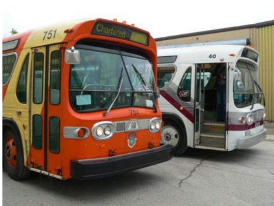
The two “Jimmies” – MTHA bus # 751 parked next to Beaver Bus Lines # 40 at the Archibald Garage.

Convention delegates had the opportunity to ride in luxury on the MTHA’s 1956 Western Flyer “Scenic Cruiser” for a trip to the Airport and new Greyhound bus depot.