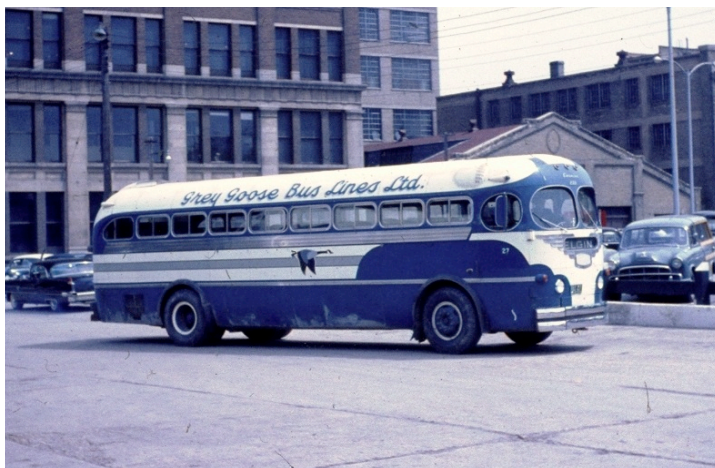
Grey Goose # 27, a 1950 MCI Courier model 100, arriving at the bus depot on Graham at Hargrave in Winnipeg in 1952.

The following page features a table listing the latest status of all vehicles from the Grey Goose fleet.