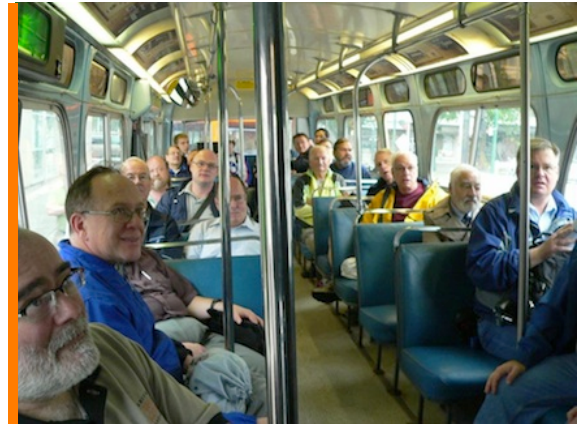
BHA Delegates enjoy their ride on MTHA bus 751; a 1971 General Motors model T6H-4521A. The bus shuttled delegates throughout the convention.