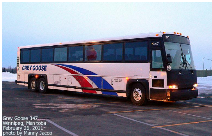
Grey Goose 347 Winnipeg, Manitoba February 26, 2011