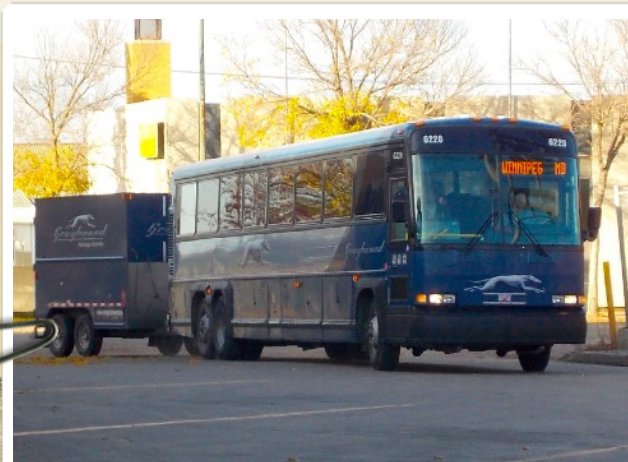
A Greyhound Canada MCI D4500 arriving in Brandon on schedule 5150.

Prior to the late 1980s, one could find daily bus service on most Manitoba Highways, operating from all of the major cities. Most of the companies above have been bought out or are defunct and no longer operate.