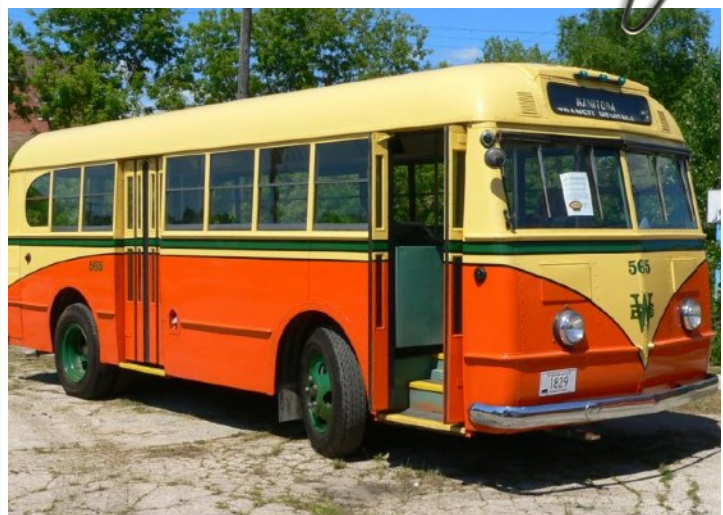
Ex-Winnipeg Electric #565, a 1942 Ford Transit model 69B is ready to travel and showcase.