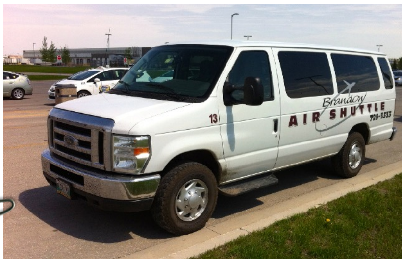
Brandon Air Shuttle #13 waits for its departure time at Winnipeg Richardson International Airport.

It is unknown if any other bus company will be applying for the operating authority for this route.