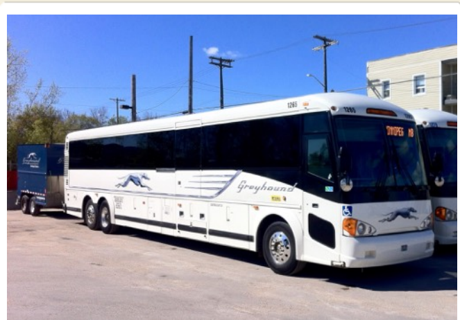
A Greyhound Canada MCI D4505 arrived in Winnipeg on schedule 5442.

Used with permission.