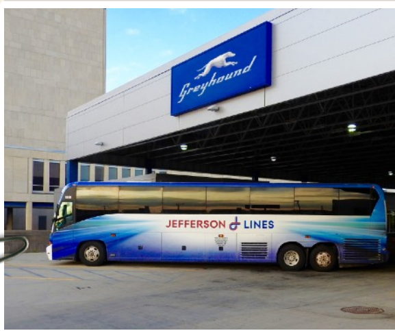
Jefferson Lines #1840 was the inaugural arrival on August 16, 2017.

A revised "flat rate" fare structure has replaced the former zone fare system, with the option of purchasing a ticket online from the Kasper website at a discounted price compared to buying at the time of boarding from the bus driver.