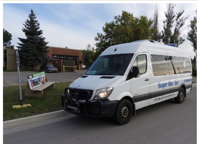
Kasper Transportation #3 arrives at its terminal stop in Selkirk, Manitoba.