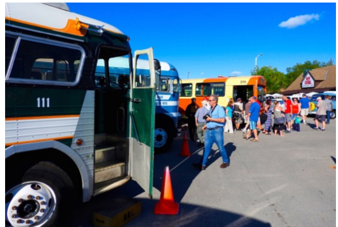
On display at the Sunday Night cruise at the Pony Coral Restaurant on Grant Avenue.