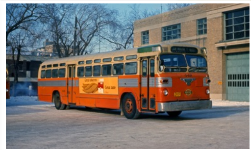
Metro Transit #449, a 1954 Fxible-Twin Coach FT2D-40.