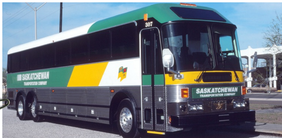
STC #307, a 1989 Eagle Coach model 20 seen at the factory in Brownsville, Texas.