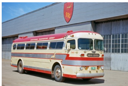
STC #541, a 1960 Western Flyer P37 Canuck.