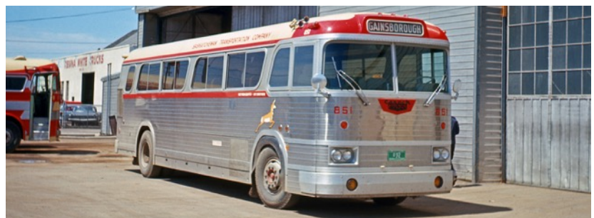
STC #851, a 1964 Western Flyer Canuck 500 seen in Regina, Saskatchewan.