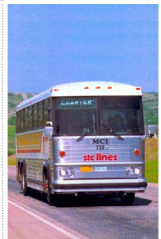
STC #734, a 1984 MC-9.