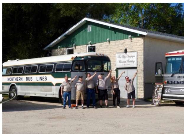
MTHA volunteers ham it up as they prepare to display in St. Anne, Manitoba.