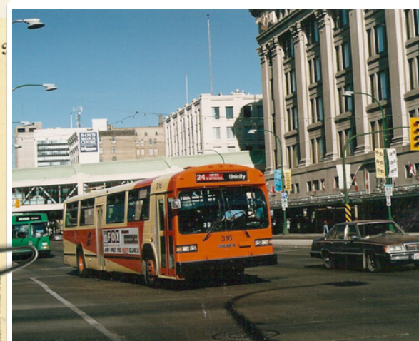
A 1988 MCI TC40102N "Classic" operating westbound on Portage Avenue.