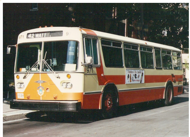
Winnipeg Transit #971, an Ontario Bus Industries model Orion 01.504