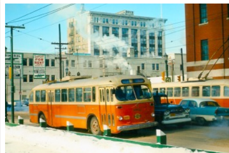
Metro Transit #1662, a 1947 CanCar-Brill model T44.