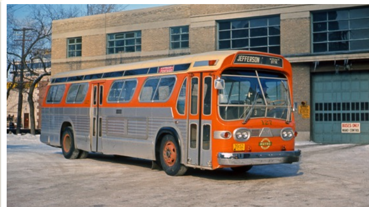
Metro Transit #127, a 1962 General Motors model TDH4517.