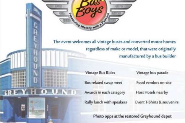
Photo opps at the restored Greyhound depot