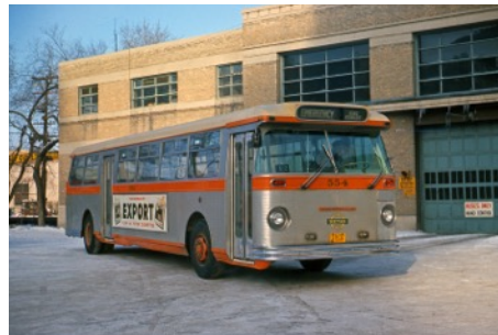
Metro Transit's #554, a 1960 CanCar "Box Car".

Winnipeg's Transit System has featured many different types of bus models from various manufacturers including Canadian Car Foundry, General Motors, and Orion Bus Industries.