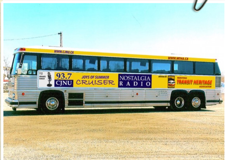
Ex-Northern Bus Lines #112 sporting a colourful vinyl wrap as the "Joys of Summer" cruiser.