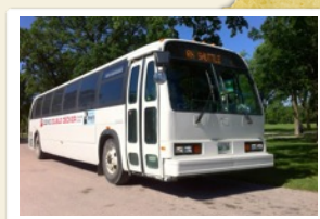
1994 RTS coach in the Park.

Assiniboine Park Free Shuttle: Watch for the MTHA's bus 62 operating on the park shuttle with the Domo Double Decker bus this summer.