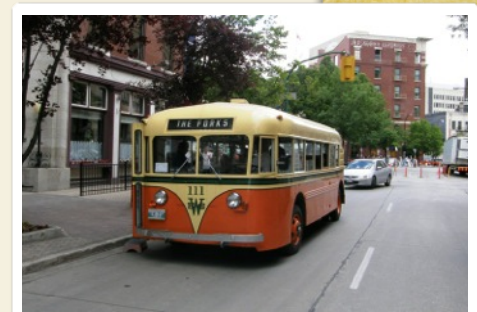
1937 Twin Coach model 23R

Article reprinted. Originally published in 1991.