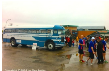
RCAF Marathon Run & Family Day