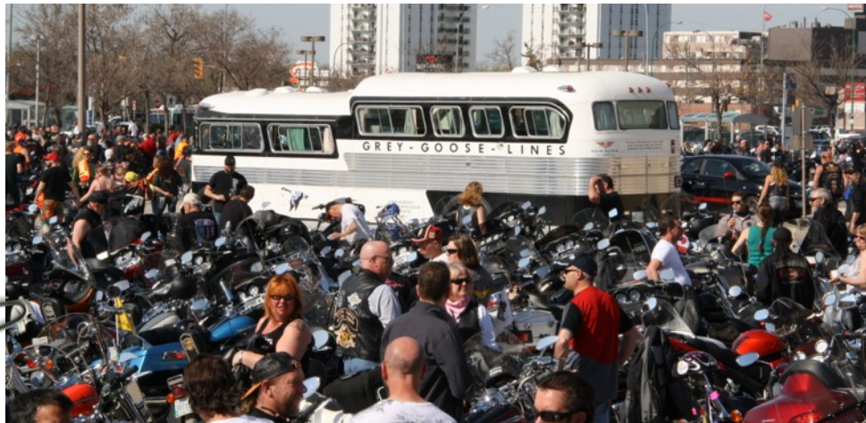
The 1956 Scenic Cruiser parked in a sea of bikers at the annual Ride For Dad