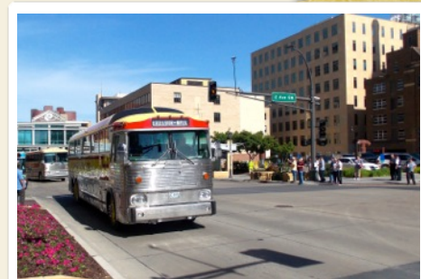
Members were busy taking pictures in Rochester, MN.