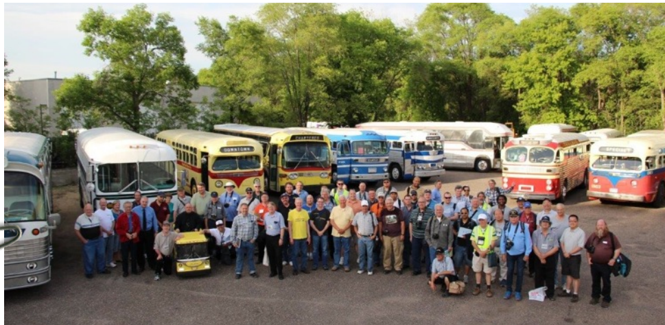
Over 62 members from around the world attended the Bus History Association Convention in Minneapolis.