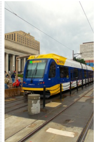
Metro Transit Green Line Opening