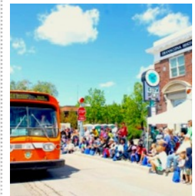
Transcona Hi Neighbour Parade

2014 is another busy year with the MTHA attending displays, community festivals, car shows and more!