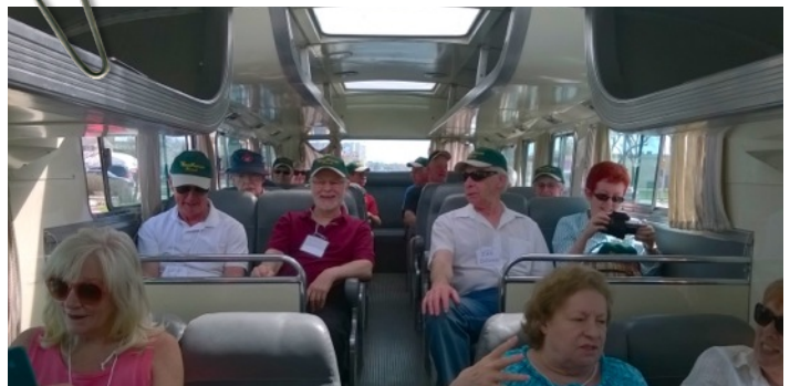
Woodhaven Neighbourhood Reunion residents enjoy a ride on the 1956 Scenic Cruiser